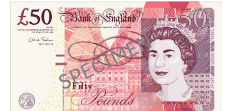
£50 fifty pound note