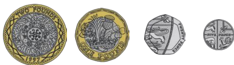
£3 and 25 pence