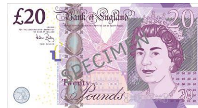
£20 twenty pound note