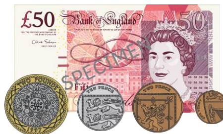
£52 and 13 pence