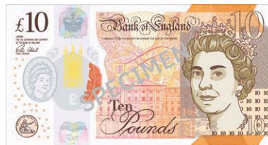
£10 ten pound note