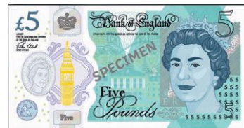
£5 five pound note